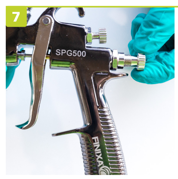
7 Install regulator knob