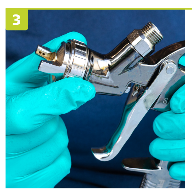
3 Install air cap