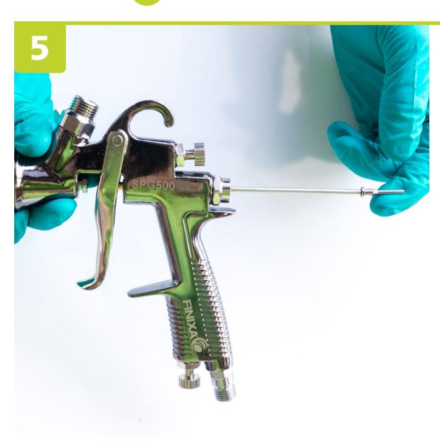
5 Insert needle