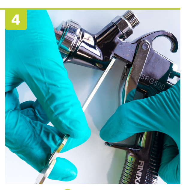
4 Loosen screw